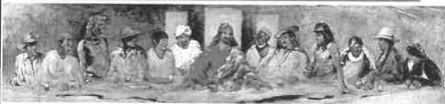
Painting by Hyatt Moore, depicting the famous scene in heaven, men from every tribe and tongue and people and nation. (Revelation 5:9). Shown here, left to right: Crow of Montana, Berber of North Africa, Masai of Kenya, China, Ecuador, Afghanistan, Jesus, Ethiopia, Tzeltal of Mexico, Canela of Brazil, Papua New Guinea, Salishi of British Columbia, Mongolia, www.hyattmoore.com .