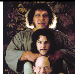
Hung out with Andre the Giant