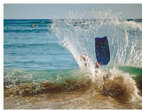
Wiped out and broke back bones