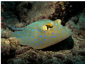
Stabbed by Blue Spot Ray