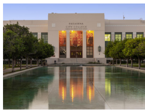
Went to college in fourth grade